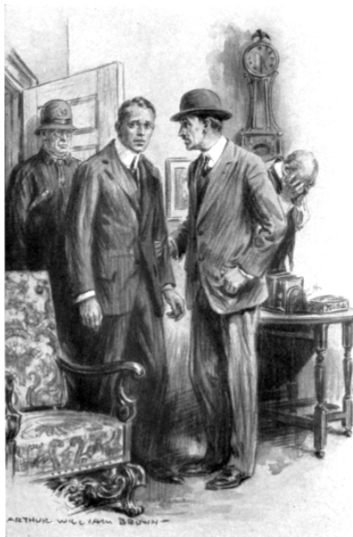
A day later he was arrested at Firehill and taken to Bloomington jail