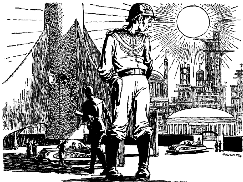
Illustrated by Paul Orban

nishings from the adjacent village. When the inhabitants returned, after the purposes of the visiting Earthman were acknowledged to be harmless, they proved to be too courteous to carp about a few missing articles.