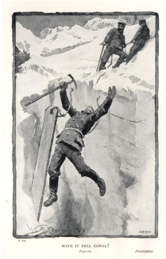
WITH IT FELL CONAL! Page 162