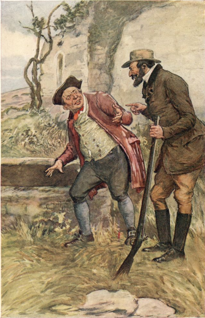
" THERE WAS NO ONE TO HEAR THE SHORT DIALOGUE THAT ENSUED AT THE HEAD OF THE WELL."

"THERE WAS NO ONE TO HEAR THE SHORT DIALOGUE THAT ENSUED AT THE HEAD OF THE WELL."