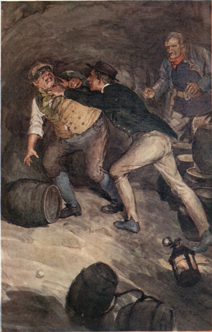
"DICK RUSHED LIKE A WHIRLWIND ON THE MAN."