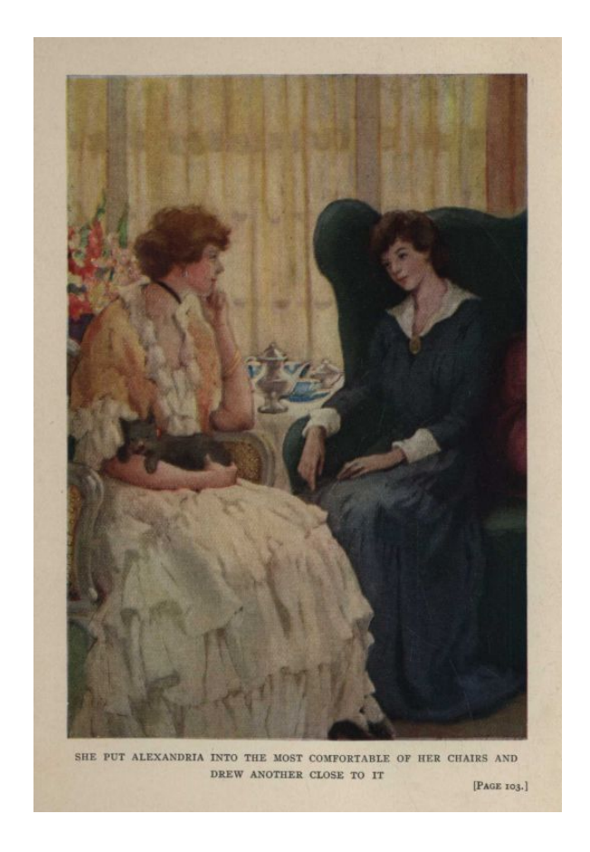
SHE PUT ALEXANDRIA INTO THE MOST COMFORTABLE OF HER CHAIRS AND DREW ANOTHER CLOSE TO IT. PAGE 103.