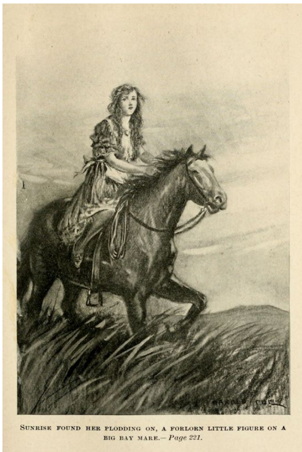
SUNRISE FOUND HER PLODDING ON, A FORLORN LITTLE FIGURE ON A BIG BAY MARE.— Page 221.

Sunrise found her plodding on, a forlorn little figure on a big bay mare, tears running down her face, and muffled sobs shaking her.