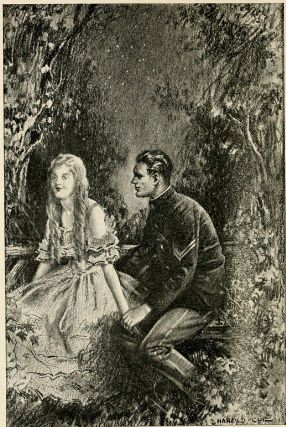
"SOMETHING NEARER, DEARER, SWEETER THAN A SISTER—I WANT YOU FOR MY WIFE!"—Page 356.