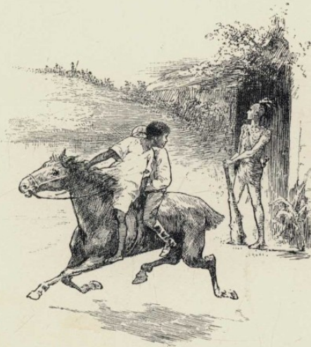
FLEEING FROM THE TANA.