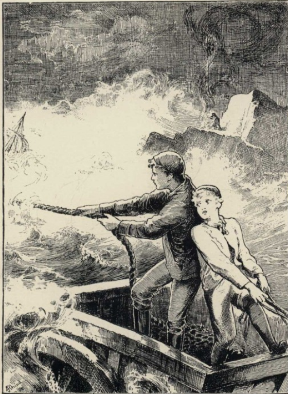
A PERILOUS RESCUE.