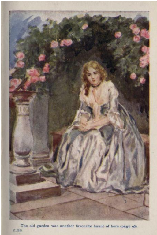
The old garden was another favourite haunt of hers (page 96).

he was proud to find in his daughter an erudition and talent very rare amongst women in those days.