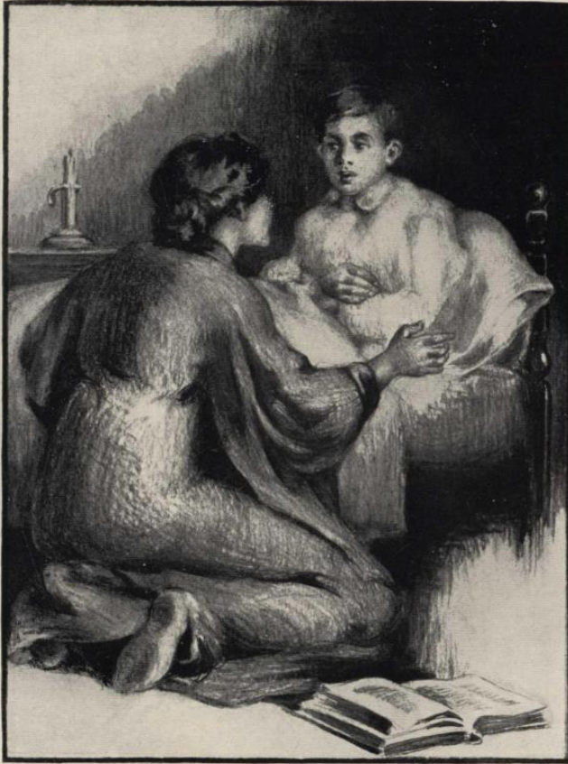
"LITTLE BROTHER, LITTLE BROTHER, LET ME TELL YOU A STORY AS I USED TO" (page 195)

"LITTLE BROTHER, LITTLE BROTHER, LET ME TELL YOU A STORY AS I USED TO" (Page 195)