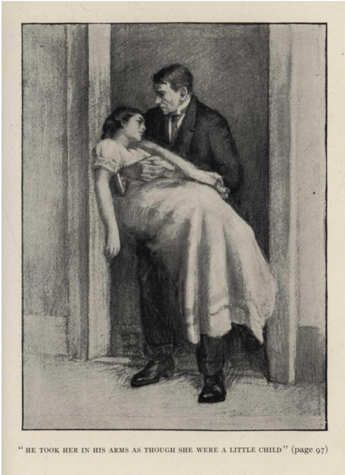
"HE TOOK HER IN HIS ARMS AS THOUGH SHE WERE A LITTLE CHILD" (page 97)