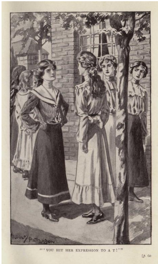
“YOU HIT HER EXPRESSION TO A T!”