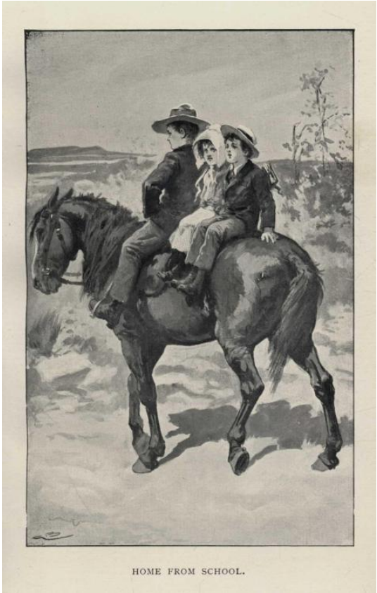
HOME FROM SCHOOL.