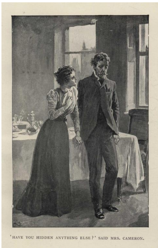
'HAVE YOU HIDDEN ANYTHING ELSE?' SAID MRS. CAMERON.