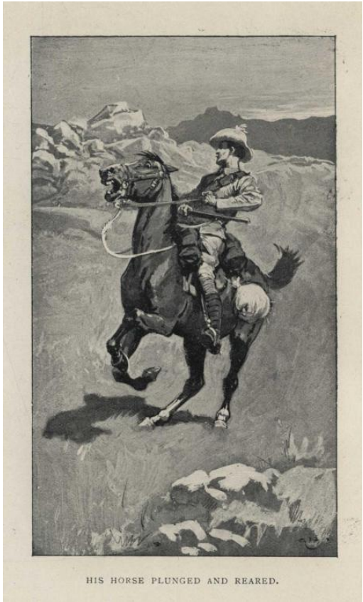
HIS HORSE PLUNGED AND REARED.

absurd, for no shrub was more than two or three feet high. He raised his revolver; his finger was at the trigger. Then he saw three small faces over the edge of one of the bushes—three that he knew; they were the stolid, secret-looking little boys who had lighted him to the stable last night.