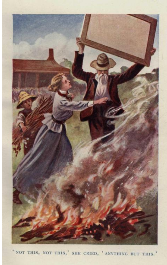
'NOT THIS, NOT THIS,' SHE CRIED, 'ANYTHING BUT THIS.'