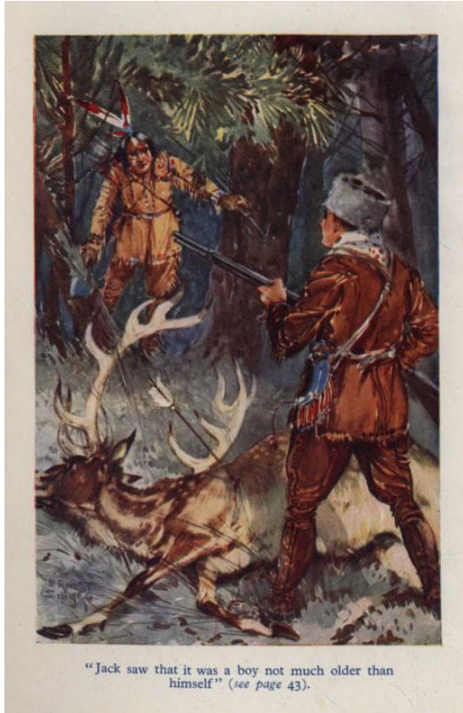
"Jack saw that it was a boy not much older than himself" (see page 43).