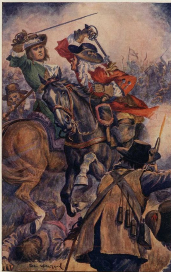
C 740 "AS HE FLEW BY HE AIMED A SAVAGE BLOW AT ME"

"AS HE FLEW BY HE AIMED A SAVAGE BLOW AT ME" (Page 217)