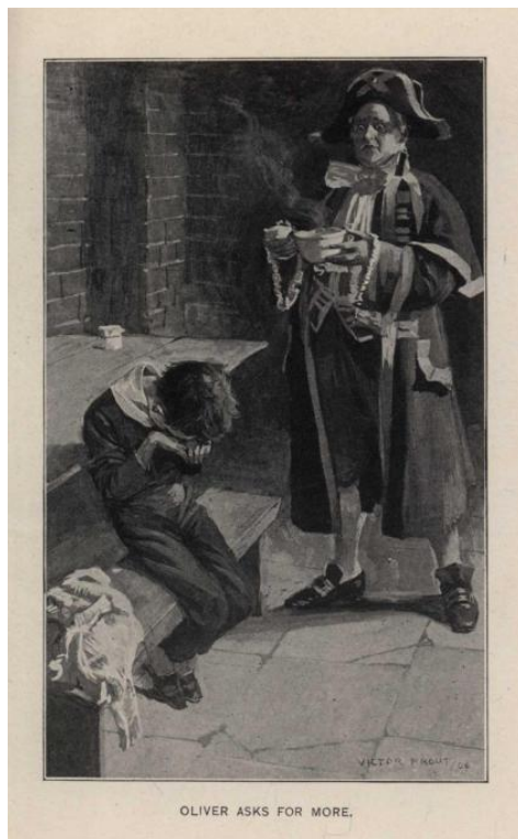
OLIVER ASKS FOR MORE.

and assisted by one or two women, ladled the gruel at meal times. Of this festive composition each boy had one porringer, and no more—except on occasions of great public rejoicing, when he had two ounces and a quarter of bread besides. The bowls never wanted washing. The boys polished them with their spoons till they shone again; and when they had performed this operation (which never took very long, the spoons being nearly as large as the bowls), they would sit staring at the kettle, with eager eyes, as if they could have devoured the very bricks of which it was composed; employing themselves, meanwhile, in sucking their fingers, with the view of catching up any stray splashes of gruel that might have been cast thereon.