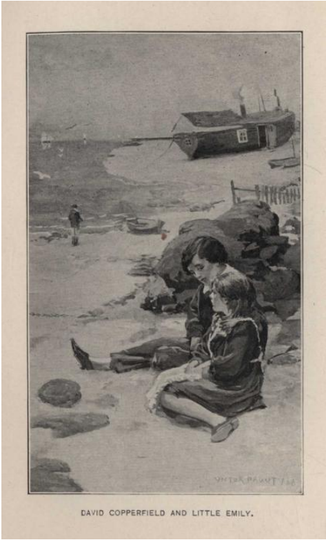
DAVID COPPERFIELD AND LITTLE EMILY.