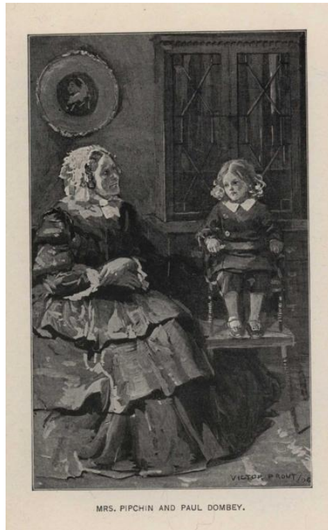
MRS. PIPCHIN AND PAUL DOMBEY.

His sister laughed and fondled him, and told him "No."