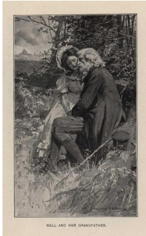
NELL AND HER GRANDFATHER.