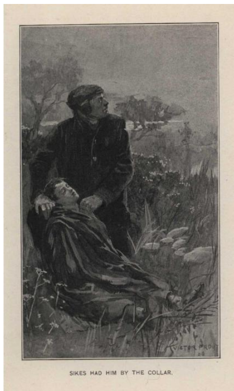
SIKES HAD HIM BY THE COLLAR.