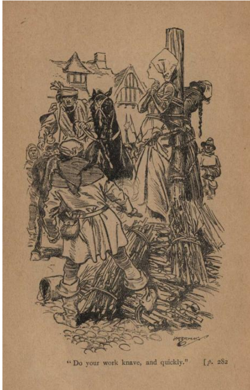
"Do your work knave, and quickly." [p. 282]

"Do your work knave, and quickly." (p. 282)