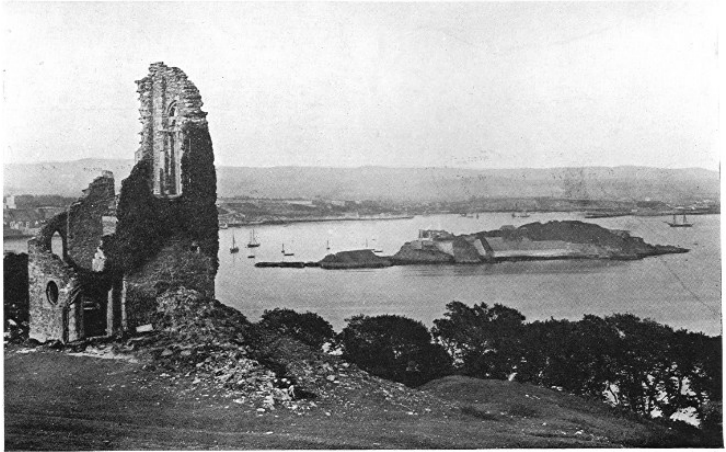
PLYMOUTH HARBOUR.

hand going in, and on the left by a peninsula, joined by a narrow sandy isthmus to the island at the head of the mole. It is strongly fortified. The harbour is a fine one, and would contain the whole British fleet. The town has a common appearance and has nothing remarkable in it. We remained here three weeks, at the end of which period we ran down to Jamaica, and anchored off Port Royal. This town is built on a small peninsula, joined to the island by a long, narrow neck of sand called the Palisades. Here all unfortunate whites who depart this life become feasts for crabs of all descriptions, as it is the place of burial for the town and men-of-war. This isthmus is the dam which secures the harbour of Kingston from the inroads of the sea. The houses of this town are generally not more than a single storey high, constructed of wood with overhanging shingled roofs, and verandahs in front, which prevent the sun entering the rooms.