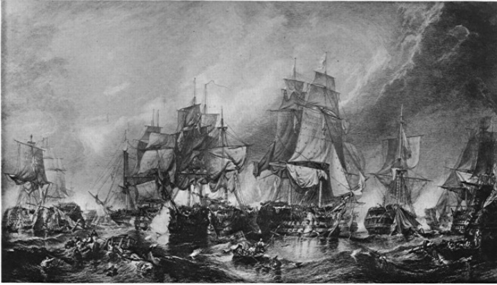
THE BATTLE OF TRAFALGAR. [C. Stansfield, R.A., Pinxit.

We answered with alacrity the signal to make all sail for the enemy, preserving our order of sailing. The sails appeared to know their places and were spread like magic. The wind was very light, and it was nearly noon before we closed with the enemy. We remarked they had formed their ships alternately French and Spanish. All our ships that had bands were playing "Rule Britannia," "Downfall of Paris," etc. Our own struck up "Britons, strike home." We were so slow in moving through the water in consequence of the lightness of the wind that some of the enemy's ships gave us a royal salute before we could break their line, and we lost two of the band and had nine wounded before we opened our fire. The telegraph signal was flying from the masthead of the Victory , "England expects every man to do his duty." It was answered with three hearty cheers from each ship, which must have shaken the nerve of the enemy. We were saved the trouble of taking in our studding-sails, as our opponents had the civility to effect it by shot before we got into their line. At length we had the honour of nestling His Majesty's ship between a French and a Spanish seventy-four, and so close that a biscuit might have been thrown on the decks of either of them. Our