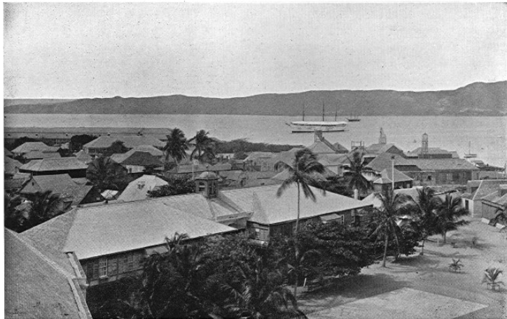
PORT ROYAL, JAMAICA.

tried, and, with the exception of two who turned King's evidence, were hanged in everlasting jackets on the small islands without Port Royal harbour. I also learnt that my former messmate was lieutenant of the watch when the mutiny broke out, and one of the King's evidence mutineers gave me the following account:—