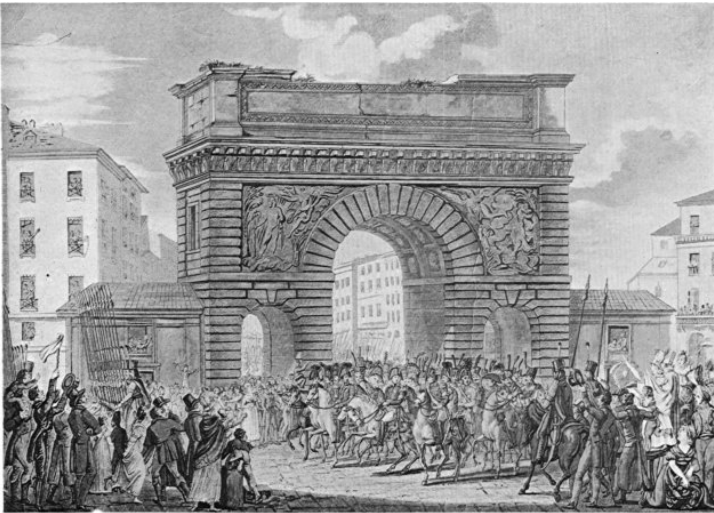
THE ENTRY OF THE ALLIES INTO PARIS BY THE PORTE ST. MARTIN, MARCH 31, 1814.

The mounted National Guard who came after the royal carriage out-Heroded Herod by their deafening cries of loyalty. Who would have imagined these gentlemen would have played the harlequin and receive their dethroned Emperor as they did when he entered Paris again? “Put not your trust in men, particularly Frenchmen in 1814, O ye house of Bourbon, for they made ye march out of France without beat of drum.”