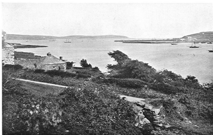
FALMOUTH HARBOUR.