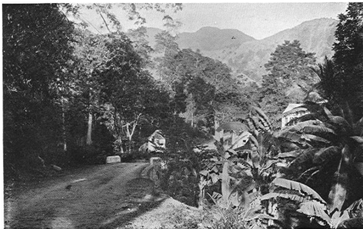
FOREST SCENERY, JAMAICA.